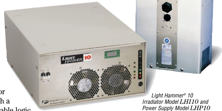
Light Hammer® 10 Irradiator Model LHI10 and Power Supply Model LHP10

The ultimate benefits of the Light Hammer 10 are the achievement of higher degrees of conversion, higher speed and better depth of cure than is typically achieved with other UV sources.